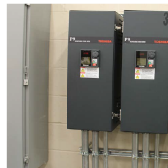
VFDs for two influent pumps